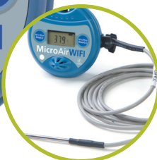
Available with external NTC probe